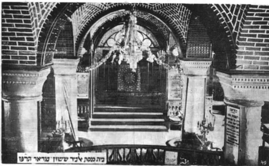
SYNAGOGUE SIR A. SASSON - BAGHDAD