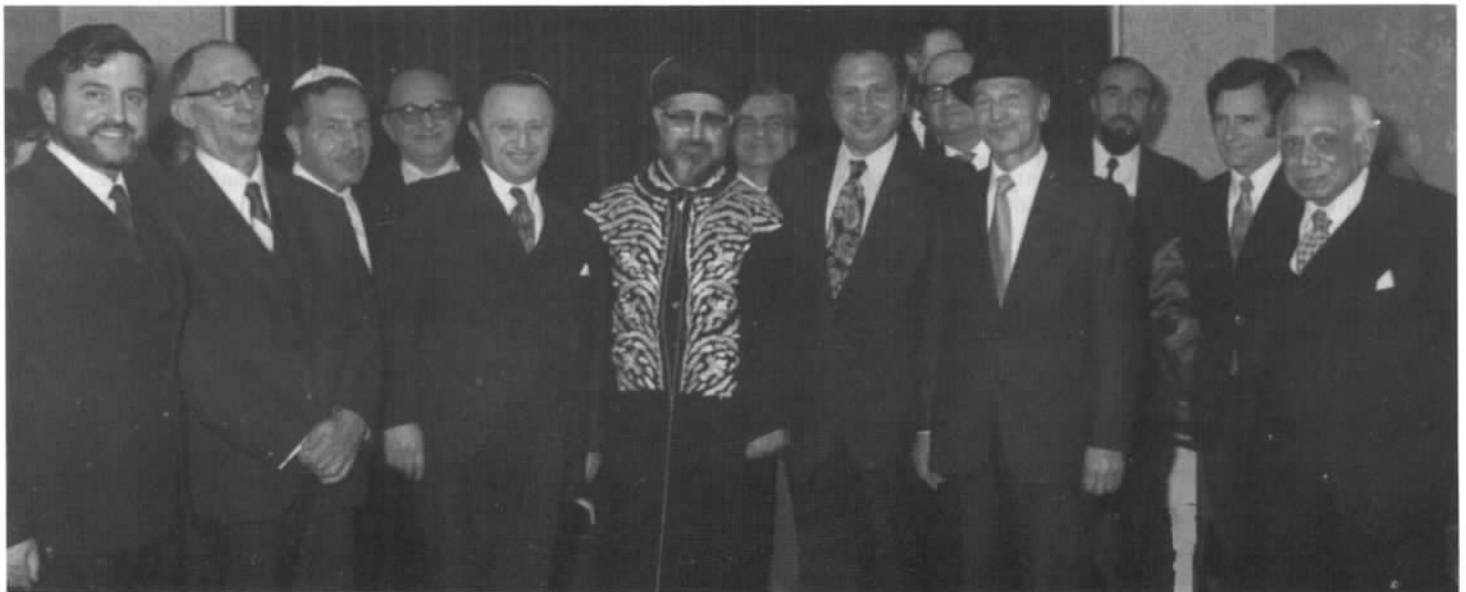
19 years ago – MAN OF THE HOUR Rav Obadia Yosef at the Iraqi Club in London.

(Rav Obadia's son tells us that his father's name is derived from Hakham Abdullah (Obadia) Somekh and Hakham Yosef Hayeem, illustrious rabbis of Baghdad)●