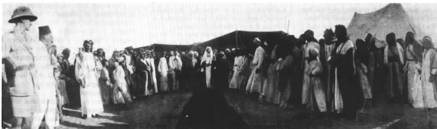
July 1921: The Amir Feisal receiving the allegiance of the Dulaim Tribe at Ramadi: "We swear allegiance to you because you are acceptable to the British Government."

To evaluate such a distributional hand add 3 points for every card over four in the trump suit, by which you will reach the magic figure of 23, or count 9 tricks and over●