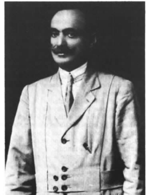
Sayyid Talib Pasha rivalled Amir Feisal for the throne of Iraq and was exiled.

The Naqib himself, Sayid Abdul Rahman Al-Gailani, President of the Council of State, was conspicuous by his absence. He was opposed to Feisal, and had previously told Miss Bell: "I would rather a thousand times have the detested Turks back in Iraq than see Sherif Hussein or his sons installed here." The Naqib's followers, the notorious people of Bab-al-Sheikh quarter, who were responsible for the anti-Jewish pogrom of 1941, also played a leading part in the bloody revolution of 1958 which put an end to Feisal's dynasty.