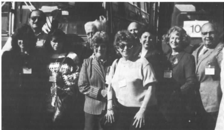
The largest single mission ever undertaken brought 700 JIA supporters to Israel to launch the 1989 Campaign.

This is the "simple automatic squeeze". There are also – the double, the progressive, the ruffing, the suicide, the jettison and other varieties of squeezes●