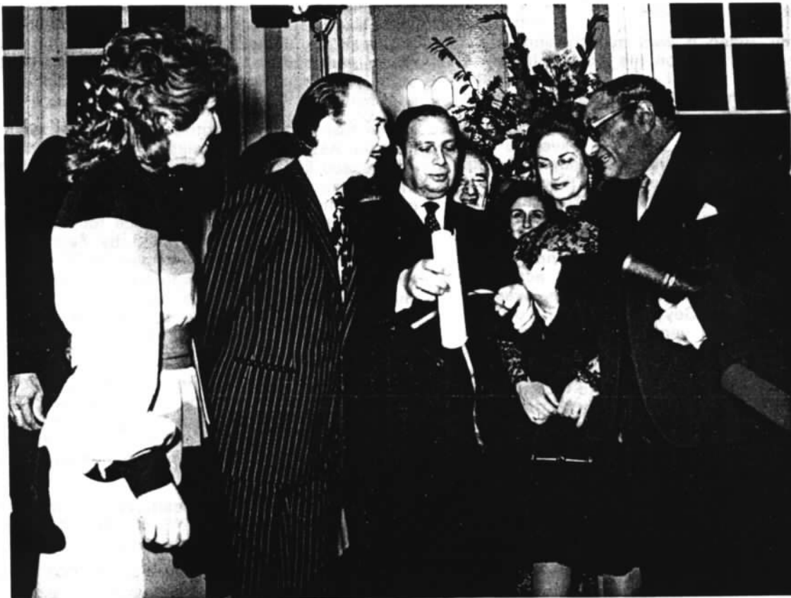
In conversation with the Ambassador before putting scroll in case