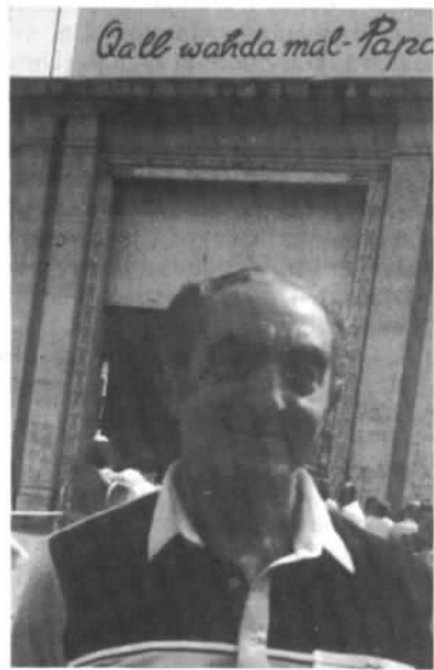
The writer in Valetta. The banner reads: Qalb wahda maal-Papa - We are all one heart with the Pope

My visit coincided with that of the Pope.