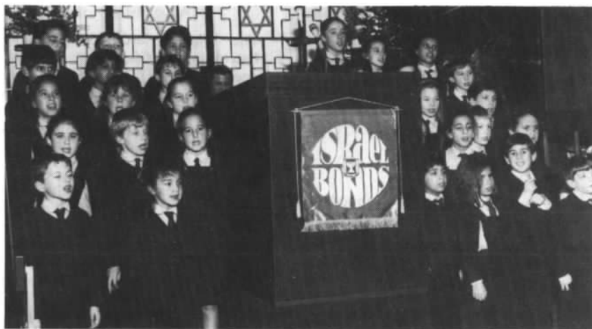
The Jewish Preparatory School choir who sang Israeli songs at the function.